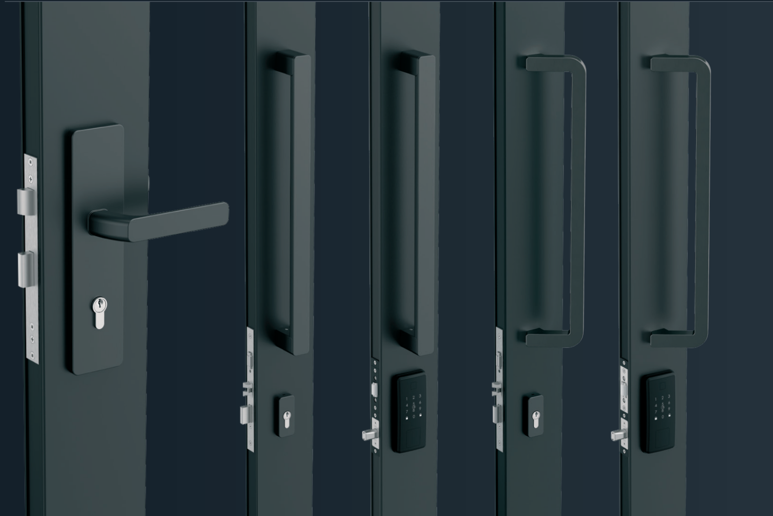
OFFSET HANDLE WITH SMART LOCK