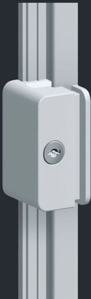
52mm Sliding Windows