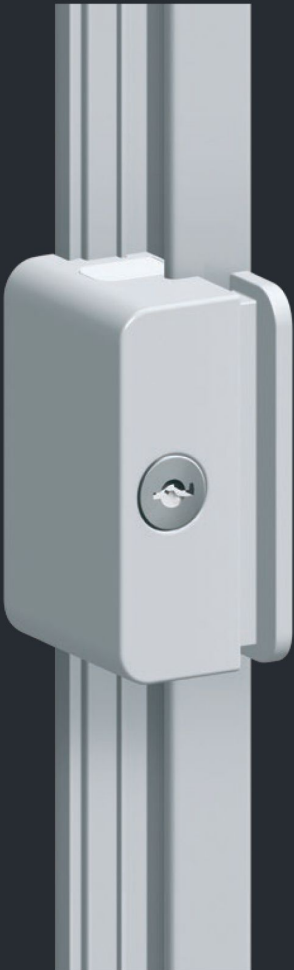
52mm Sliding Windows